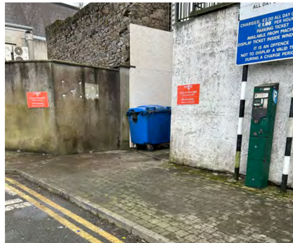
Before (below) and after (above)

The area is monitored regularly and while other measures are being progressed with the management company, it is much more proactive and promptly contacts the Longford County Council Waste Enforcement Team to investigate illegally dumped waste prior to its removal.